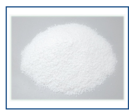
Packaging: - Available in 50 KG Carboy Packing