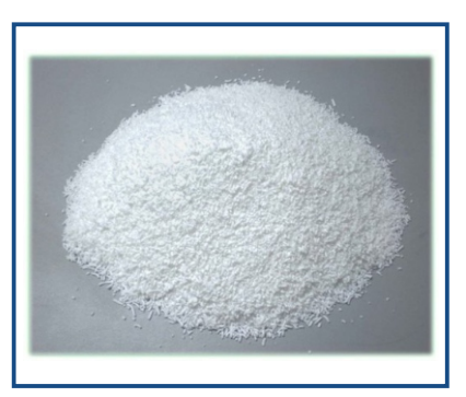
Dosage: - 100 Gm in 100 Kg Batch Size, Mix in Acid Slurry (LABSA)/ AOS